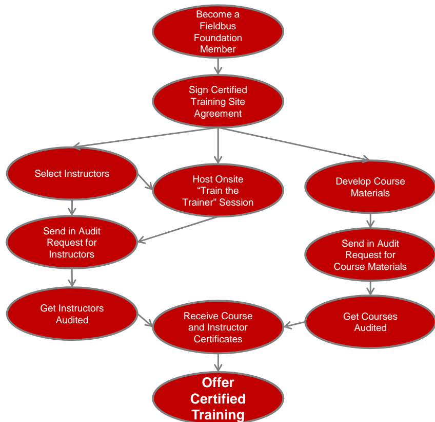
The FCTP Auditing Process

The Instructor Audit phase requires that instructors must be able to demonstrate their knowledge of each individual topic related to course materials taught. All certified instructors are expected to be able to teach all certified courses, even if the educational institution they work