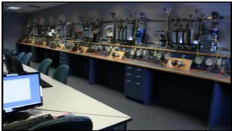
The SAIT Fieldbus Lab Provides Students with State of the Art Training

Southern Alberta Institute of Technology (SAIT) Polytechnic in Calgary, Canada was one of our first FCTP partners. Established in 1916, SAIT is Canada's premier polytechnic providing relevant, skill-oriented education to 70,000 registrants annually. SAIT offers two full baccalaureate degrees, four applied degrees, 67 certificate and diploma programs, 32 apprenticeship trades and 1,600 continuing education and corporate training courses. SAIT recently upgraded its FOUNDATION fieldbus lab to incorporate FOUNDATION HSE technology. The updated laboratory demonstrates instrument interoperability from over a dozen different manufacturers. SAIT also has the capability of delivering training on-site using portable lab kits. These kits weigh less than 50 lbs. and each case contains the complete H1 network, configuration and network diagnostic tools.