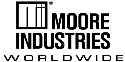
Moore Industries Worldwide - For sponsors